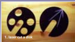
1. laser cut a disk