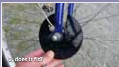
2. does it fit?