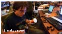
5. make a spool